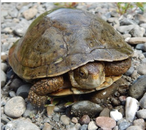
Western Pond Turtle by Peter Baye

Join the festivities by visiting any area on the Mill Bend map and enjoying a refuge where you can view Osprey, Eagles and Mergansers fishing for a meal, multitudes of butterflies visiting native wildflowers, perhaps a Gualala Roach, a fish endemic to the Gualala River, Foothill Yellow-legged frogs, river otters frolicking or spot a Spotted Sandpiper. If you are really quiet, you might see a Western Pond Turtle. Keep that camera handy!